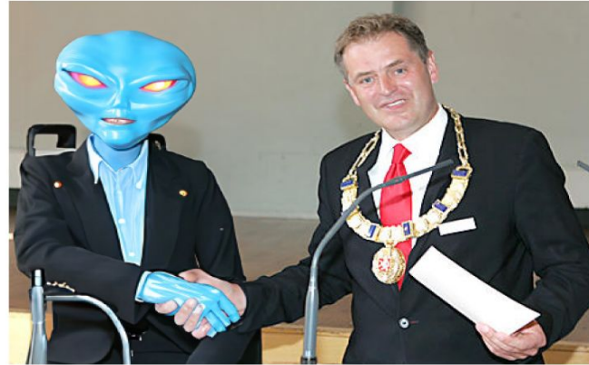
our friendly neighbour from space shaking hands with the mayor

Heavy storm surges are currently battering Gmünd 2 , posing significant risks to both the upper and lower sections of the city. Residents are urgently advised to stay indoors as flooding in the lower city and severe winds make outdoor spaces highly unsafe. The bridges are considered secure due to their construction and tube like structure. Emergency shelters are operational, stocked with essential supplies and staffed by medical professionals. For urgent assistance, please use the city's designated emergency hotline.