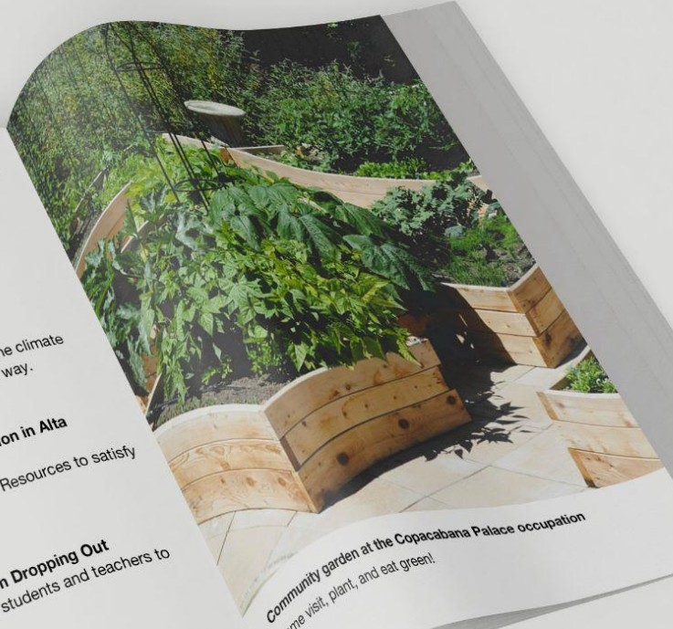
Community garden at the Copacabana Palace occupation Come visit, plant, and eat green!